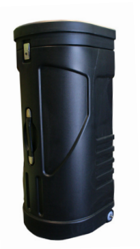
Half Hard Case is optional.